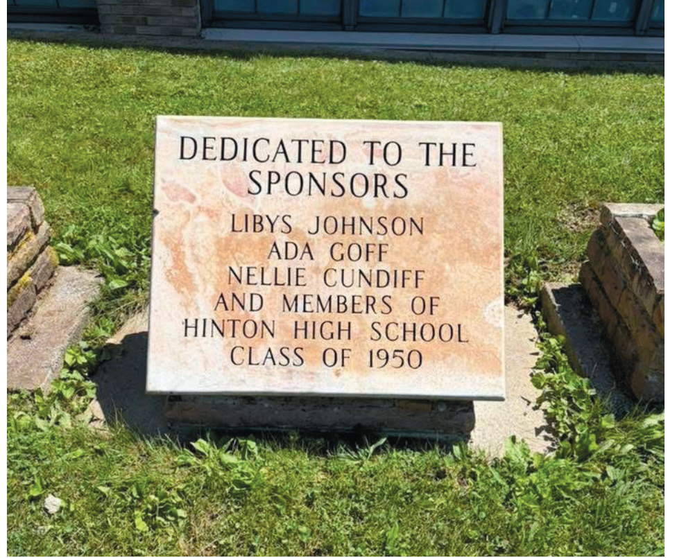
Dedication stone all cleaned up