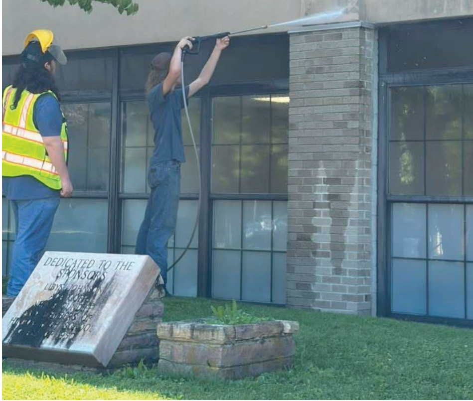
More workers applying a power wash