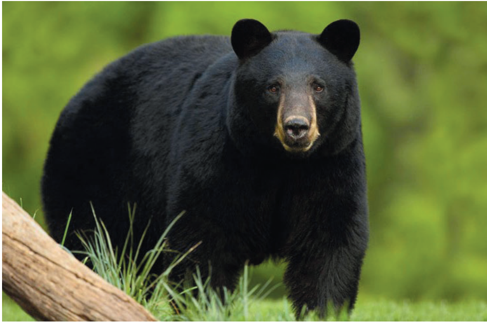
A picture of a black bear