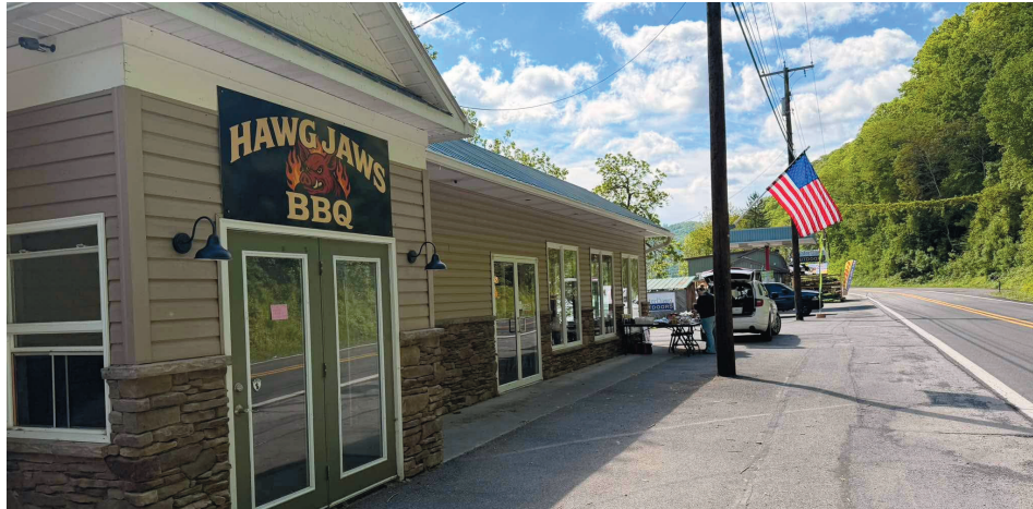
A look at the front of the restaurant