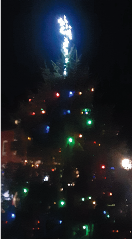
Hinton Christmas Tree 2024