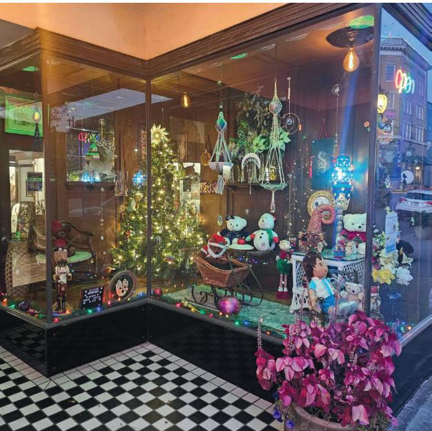
211 Gallery Christmas Past