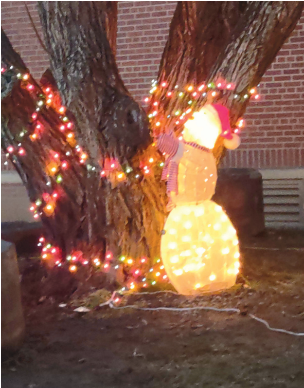
A Snowman puts up lights in Downtown Hinton Decorations in 2023.