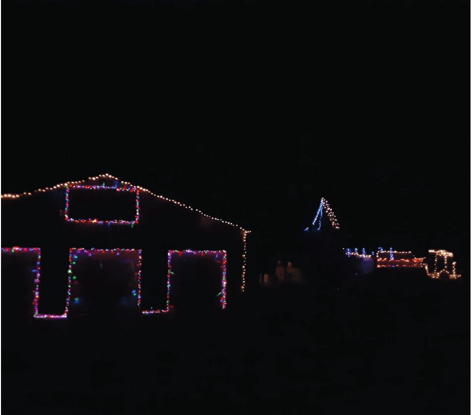
Talcott Volunteer Fire Department 2023