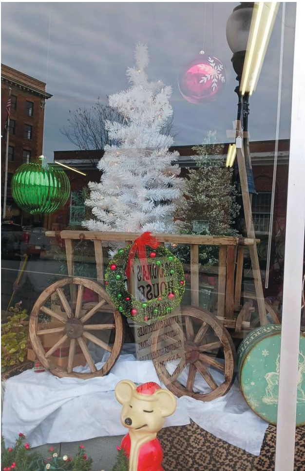
Award Winning Hinton Storefront Christmas Past