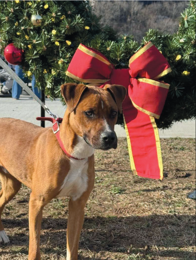
HINTON, W.Va. seeking a permanent (Hinton News) — home for Brody, a The Summers County Humane Society is