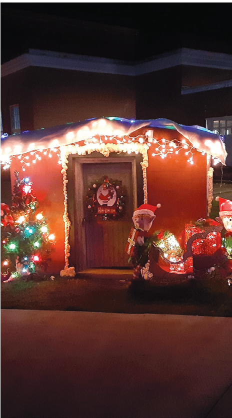
Downtown Hinton 2023