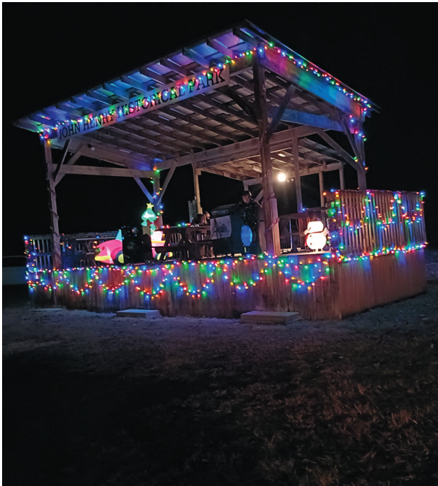
The stage at John Henry Park Decorated in 2024.