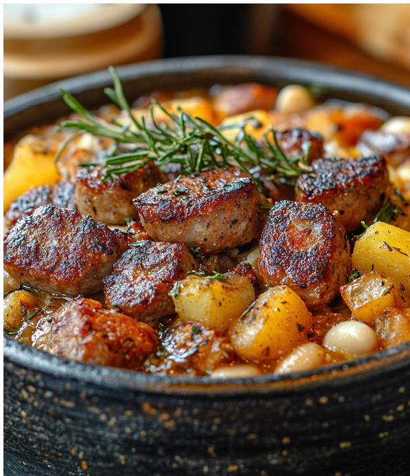
White bean duck stew by Gustard's Bistro

LEWISBURG er Valley is excited W.Va. (Hinton News) — The United Way of Greenbri-