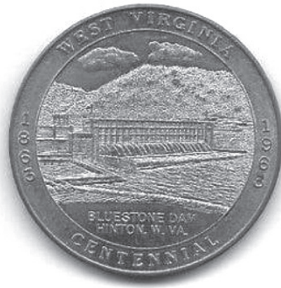
Centennial Coin from Summers County.

tique gooseneck platform rocker from someone in Alderson, West Virginia. I loaded it into our van and took it back to our house in Pence Springs. When I went to unload it this gold coin fell out from under the