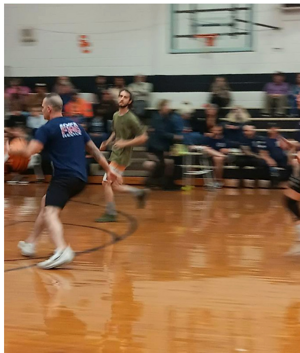
Players head down the court toward the Hose Draggers' basket.