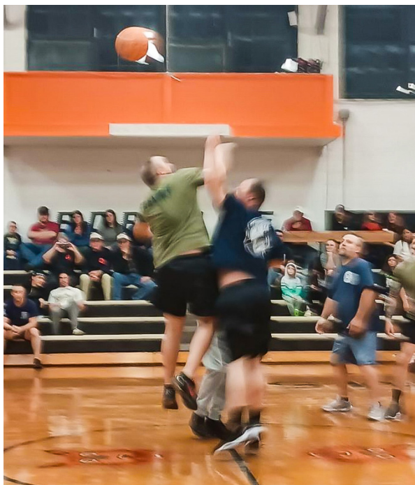
The tipoff! The ball heads into the Hose Draggers' territory.