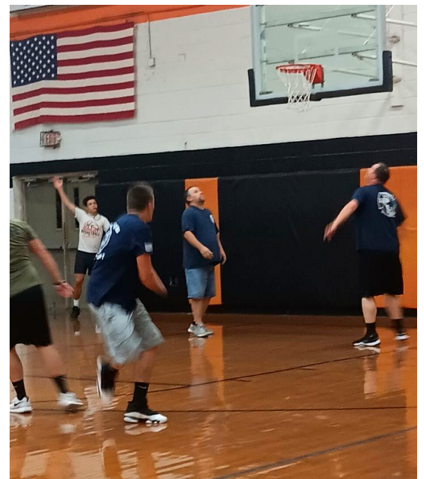
Players under the basket during gameplay.