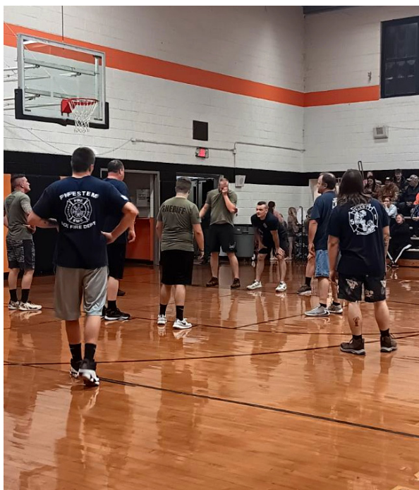
The game is underway between the Hose Draggers and Donut Eaters.