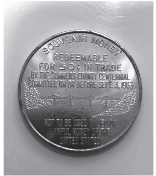
The other side of the Centennial Coin.

The first thing I thought was, "yes a gold coin!" When I bent over to pick it up to examine my newfound wealth, haha, I discovered it in fact was not a gold coin. But rather this Sum-