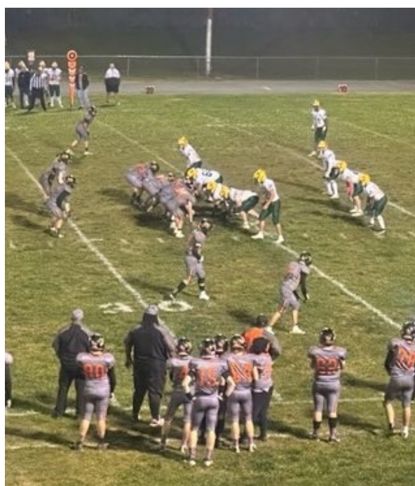
Bobcats and Spartans faceoff.