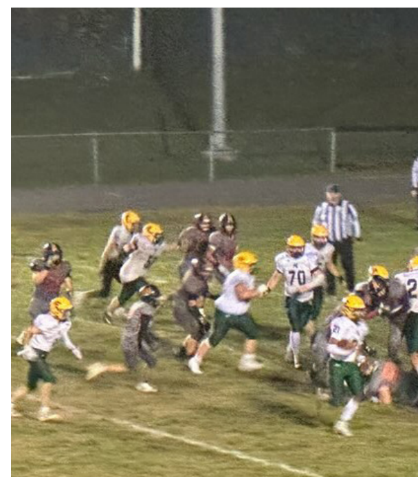
Bobcats versus Spartans.