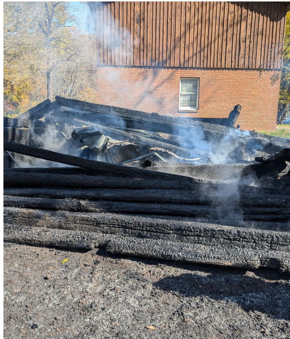
The charred remains of an outbuilding.