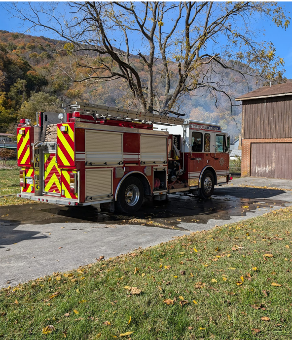
One of Summers VFD's firetrucks on scene of the fire.