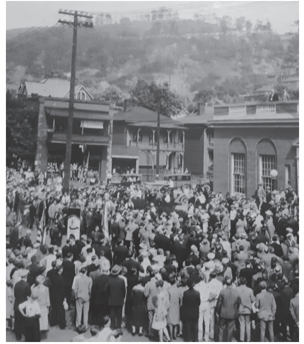
Photo of the Hinton Post Office building dedication ceremony in 1926.

The following is an excerpt taken from the postal history of Hinton. "City delivery service started in Hinton