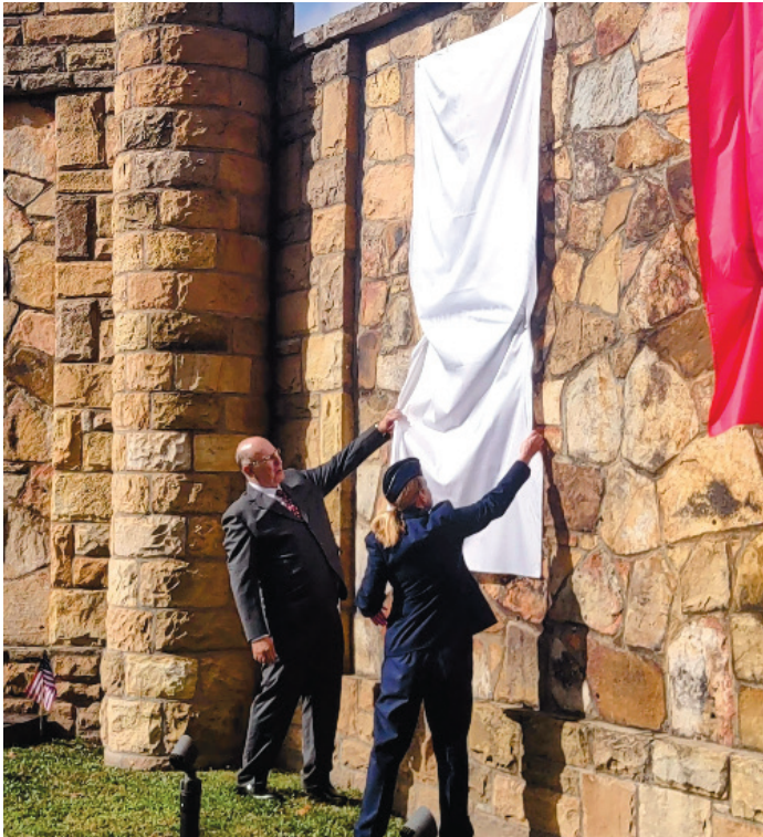
Local service members pulling the covering off one of the new plaques.