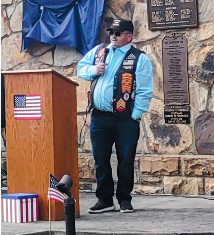
One of the guest speakers during the ceremony.