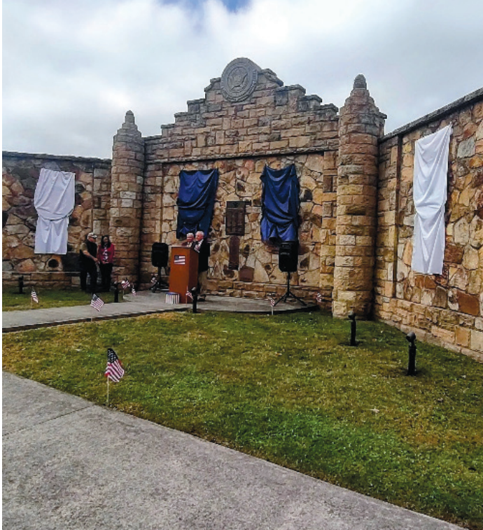
A view of the wall prior to the unveiling.