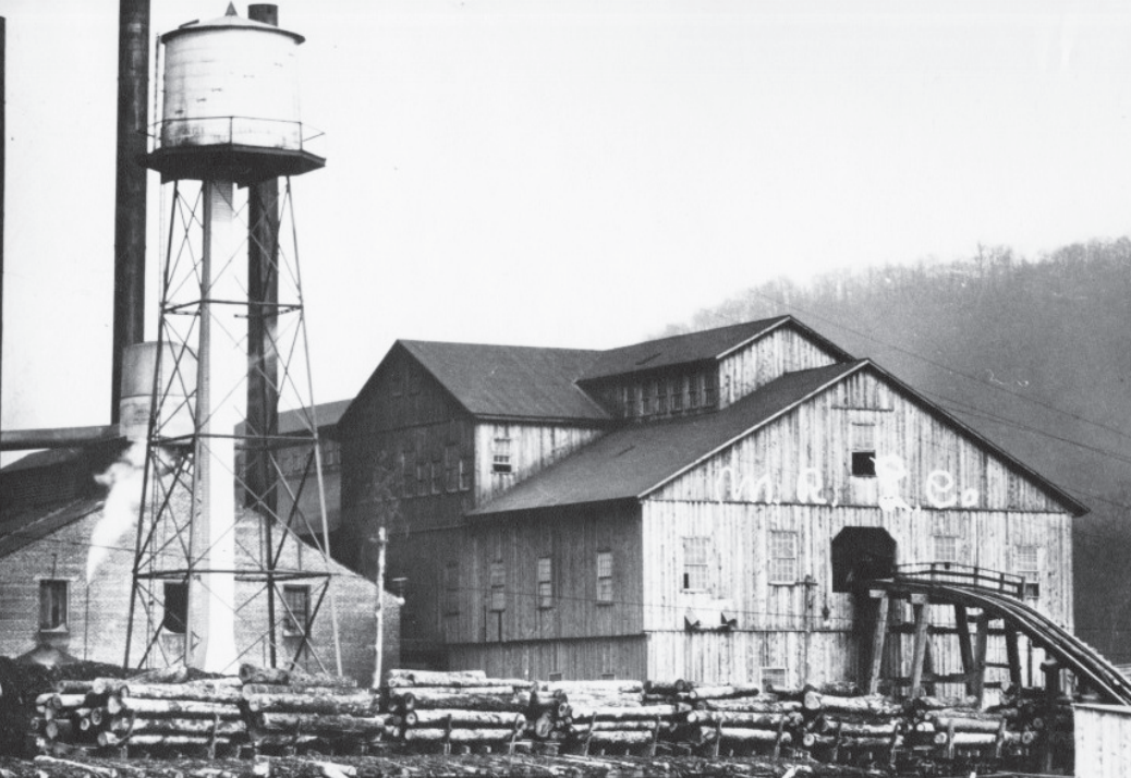
The original Meadow River Lumber Company.