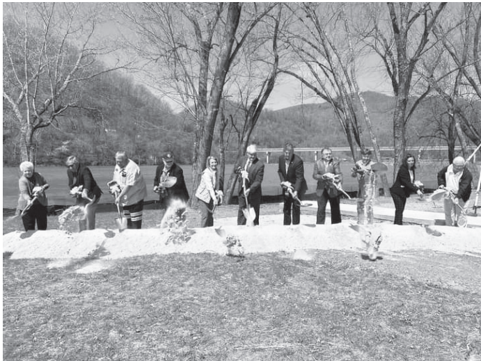
Batteau Beach at Hinton Landing groundbreaking.

Senator Capito, another supporter of the project, said, “This is a critical aspect in making Hinton a true destination that appeals to more tourists and visitors alike!”