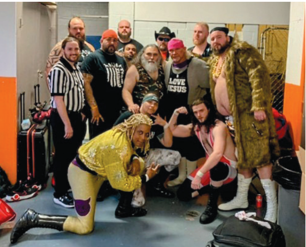
All of the wrestlers before the event.

American Pro Wrestling will be back in Hinton in May, exact dates are yet to be announced. Stick with Hinton News for more details as they become available.