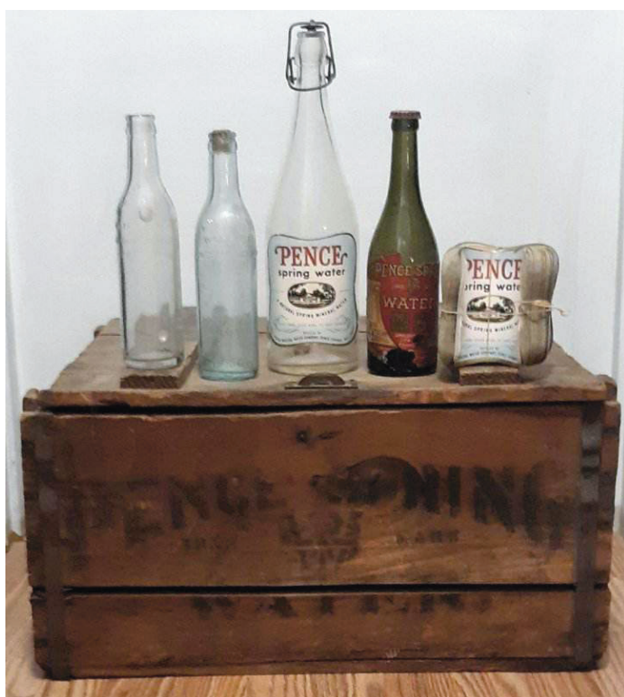
Bottles are a crate from Pence Springs' past.