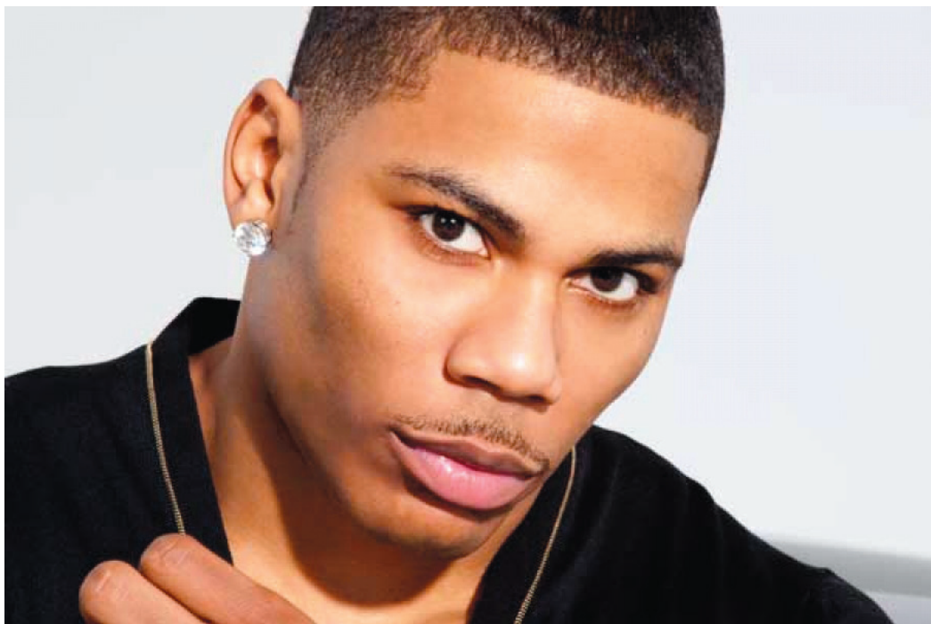
Nelly returns to the State Fair of West Virginia on Aug. 11.

Diamond Selling, Multi-platinum, Grammy award-winning rap superstar, entrepreneur, philanthropist and actor, Nelly has continually raised the bar for the entertainment industry since stepping on the scene in 2000 with his distinctive vocals and larger-than-life personality. His collaboration with Florida Georgia Line received Diamond status and he is only one of seven rappers to reach this honor. He is touring around the globe and recently was the first artist to play in Saudi Arabia with a mixed gender/family crowd. He is the first hip hop artist to play with multiple symphonies nationwide and played himself in BET's Real Husbands of Hollywood with Kevin Hart. His sports knowledge and love of all sports secured him a gig as a sportscaster with Skip Bayless. 2019 is going to be a huge year