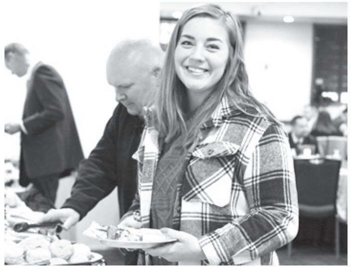
A student attending the event.