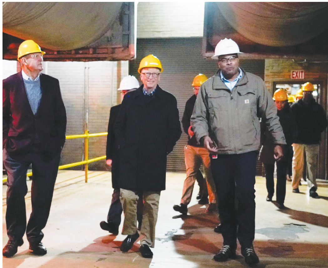
Sen. Joe Manchin (D-WV) welcomed Bill Gates to West Virginia on Monday, Jan. 9.

CHARLESTON, W.Va. (Hinton News) – U.S. Senator Joe Manchin, D-W.Va., chairman of the Senate Energy and Natural Resources Committee, welcomed Bill Gates, founder of Breakthrough Energy, to West Virginia on Monday to highlight the role the Mountain State has played in powering the nation.