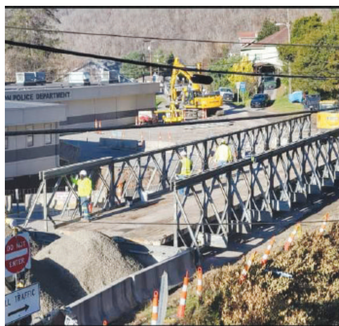
Day two of construction.

Hinton News will continue to provide updates on the long-term project.