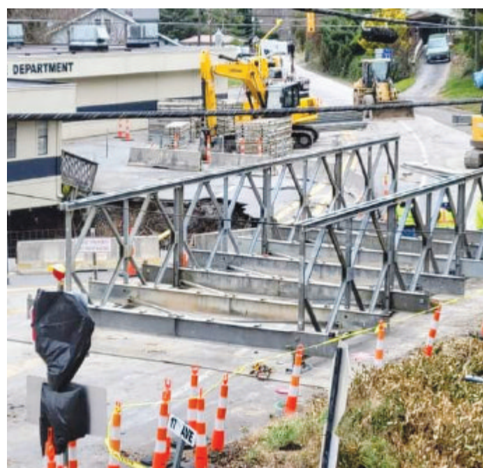
Early construction on the bridge.

DOH crews installed a 120-foot temporary culvert and fill material under the road to stabilize the situation. Unfortunately, rain from Hurricane Nicole caused the fill material to wash out, and the collapse ex-