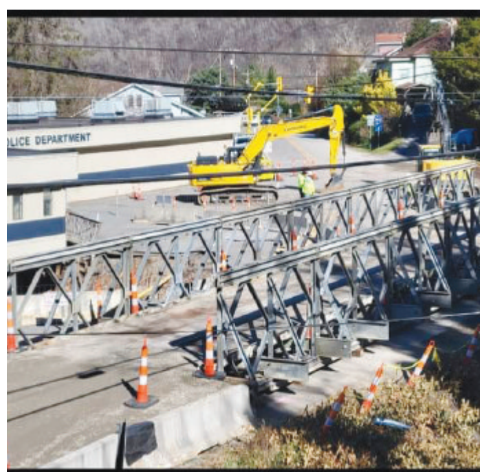
Nearing completion on Sunday.