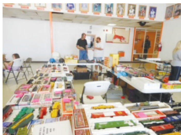
Vendors at a past Railroad Days event.

In addition to the many vendors and activities, the Veterans Museum, the Campbell-Flannagan-Murrell House Museum and