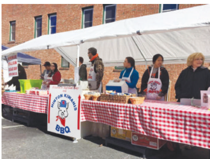
Vendors at a past Railroad Days event.